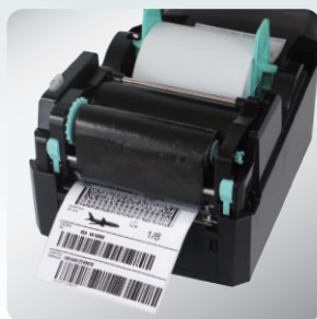
Uses standard low-cost labels and ribbons