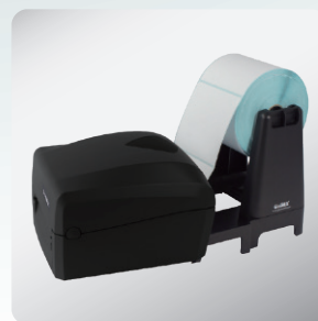
High cost-effectiveness for large amount printing