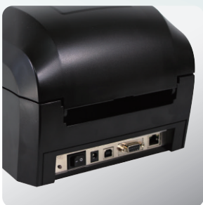
Ethernet, Serial and USB ports included

Use the GE300 for all you light to medium duty thermal transfer barcode printing applications