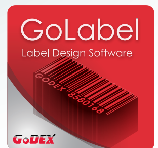
Free labeling software GoLabel for easy printing